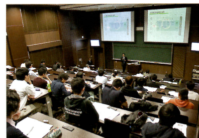
Life Insurance Forum

We support several universities which hold the course related to life insurance to provide students with opportunities to further develop their knowledge about life insurance and nurture human resources for the life insurance business in the future. We have sponsored the OLIS Life Insurance Endowed Course at Keio University since 2010 and at Chuo University since 2014.