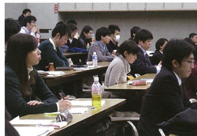
Life Insurance Forum

We have sponsored the OLIS-Prudential-Gibraltar Life Insurance Endowed Course at Keio University since 2010. We aim to provide KU students with opportunities to further develop their knowledge about life insurance and nurture human resources for the life insurance business in the future.